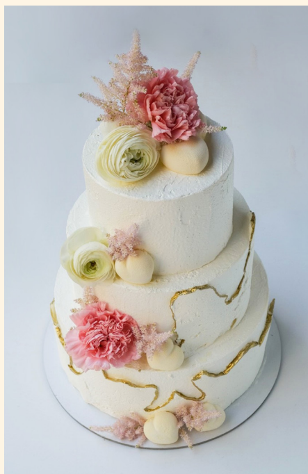
NAZIV: PRINCESS WEDDING TEŽINA: 9 kg (3.990 rsd / 1 kg) CENA DEKORACIJE: NAME: PRINCESS WEDDING WEIGHT: 9 kg (3.990 rsd / 1 kg) DECORATION PRICE: 2000 rsd