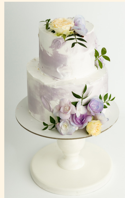
NAZIV: BELLA TEŽINA: 5 kg (3.990 rsd / 1 kg) CENA DEKORACIJE: 2500 rsd NAME: BELLA WEIGHT: 5 kg (3.990 rsd / 1 kg) DECORATION PRICE: 2500 rsd