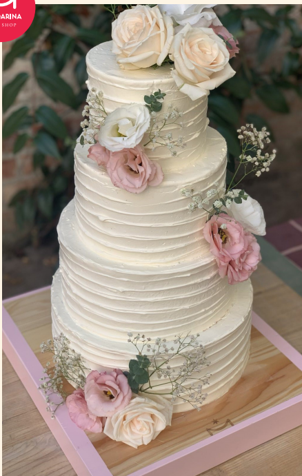
NAZIV: TENDER TOUCH TEŽINA: 14 kg (3.990 rsd / 1 kg) CENA DEKORACIJE: 6000 rsd NAME: TENDER TOUCH WEIGHT: 14 kg (3.990 rsd / 1 kg) DECORATION PRICE: 6000 rsd