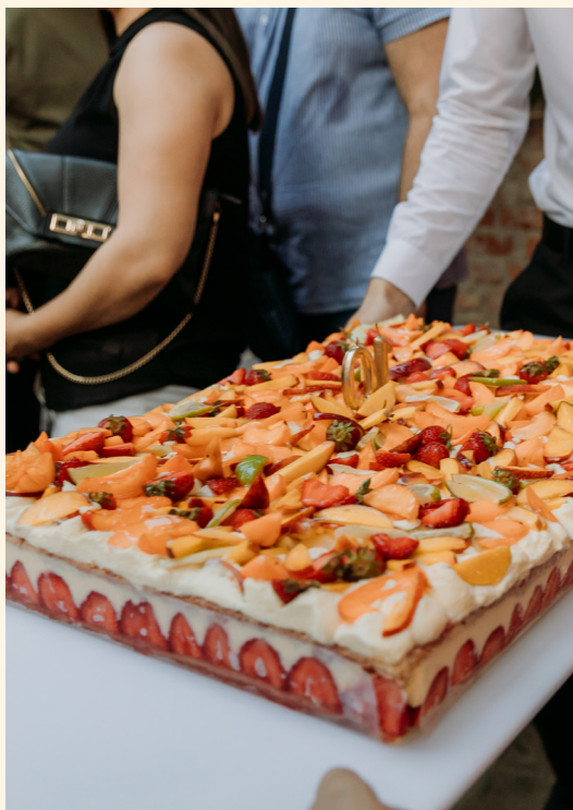
NAZIV: PEACHBERRY BLOOM TEŽINA: 10 kg (3990rsd / 1 kg) NAME: PEACHBERRY BLOOM WEIGHT: 10 kg (3990rsd / 1 kg)