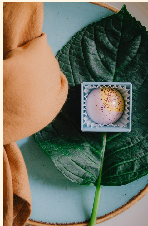
NAZIV: Poklon Pralina MOGUĆI UKUSI: Crna ili bela čokolada sa malinom i pistačima. CENA: 250 rsd / kom