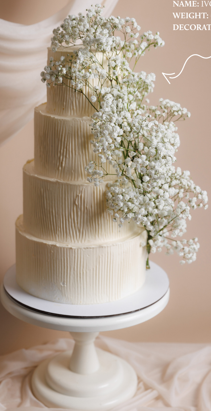
NAZIV: IVORY GARDEN TEŽINA: 5 kg (3.990 rsd / 1 kg) CENA DEKORACIJE: 2.500 rsd NAME: IVORY GARDEN WEIGHT: 5 kg (3.990 rsd / 1 kg) DECORATION PRICE: 2.500 rsd