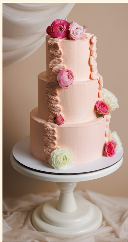
NAZIV: ROSE ROMANCE TEŽINA: 6,5 kg (3.990 rsd / 1 kg) CENA DEKORACIJE: 2.500 rsd NAME: ROSE ROMANCE WEIGHT: 6,5 kg (3.990 rsd / 1 kg) DECORATION PRICE: 2.500 rsd