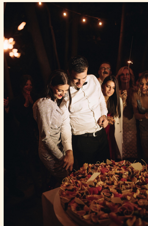
NAZIV: SUMMER BLOOM TEŽINA: 14kg CENA PO KILOGRAMU: 3,990 RSD NAME: SUMMER BLOOM WEIGHT: 14kg CENA PO KILOGRAMU: 3,990 RSD