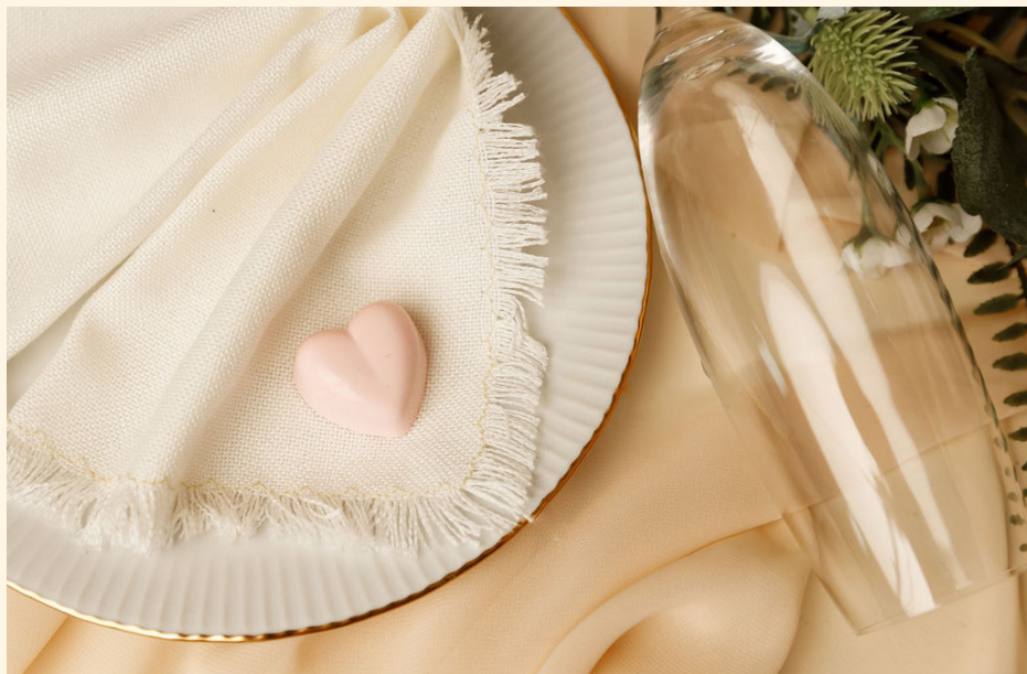
NAME: Heart-Shaped Praline CENA: 90 rsd / one piece