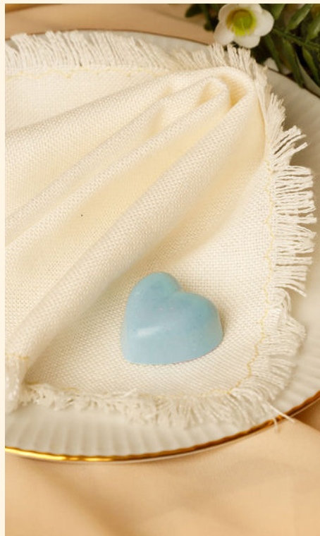
NAZIV: Srce pralina CENA: 90 rsd / kom